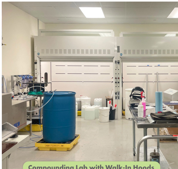
Compounding Lab with Walk-In Hoods